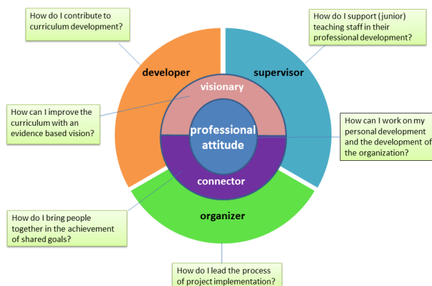
Figure 1 - The five roles of the STQ

The STQ programme helps both participants and degree programmes in their pursuit of further professional development and thereby aims to enhance the quality of university education.